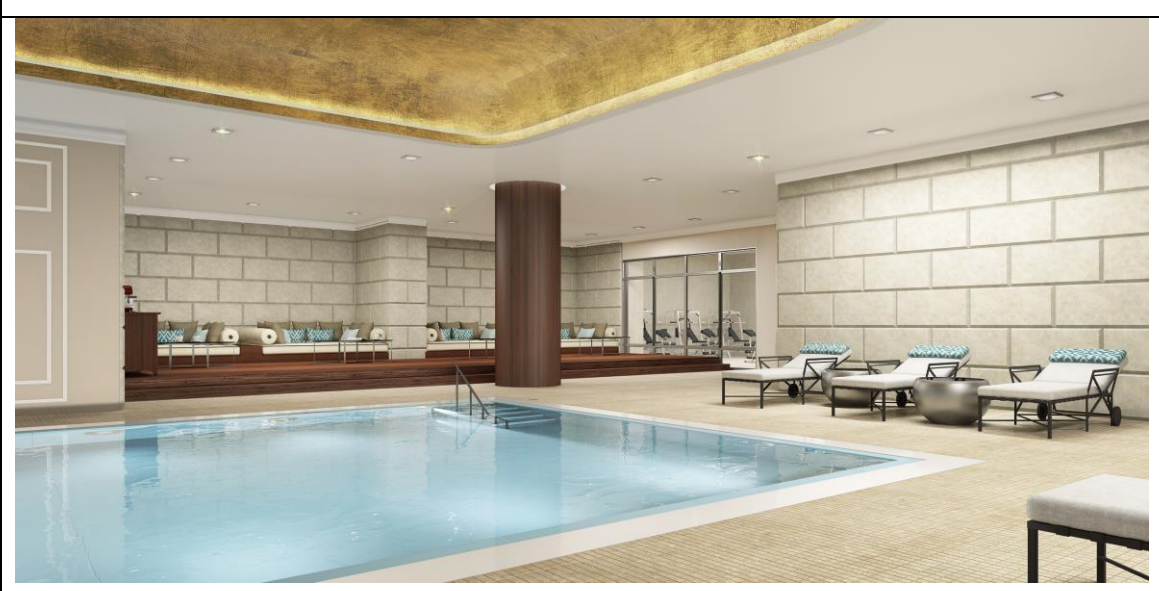
Spa & Health

Suitable occupancy a couple or couple and a child.